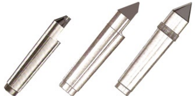
Carbide Revolving centres , Dead Centres ,half centres , Female centres, Threaded centres ,Bull nose centres