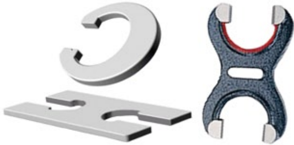
Carbide Snap gauges (std & spls)