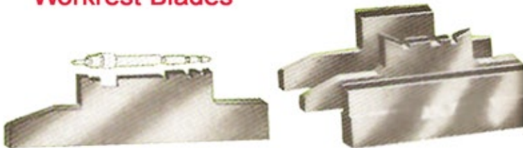
Workrest Blades : Carbide Workrest Blades For centerless grinders, profile workrest blades, sheering blades.