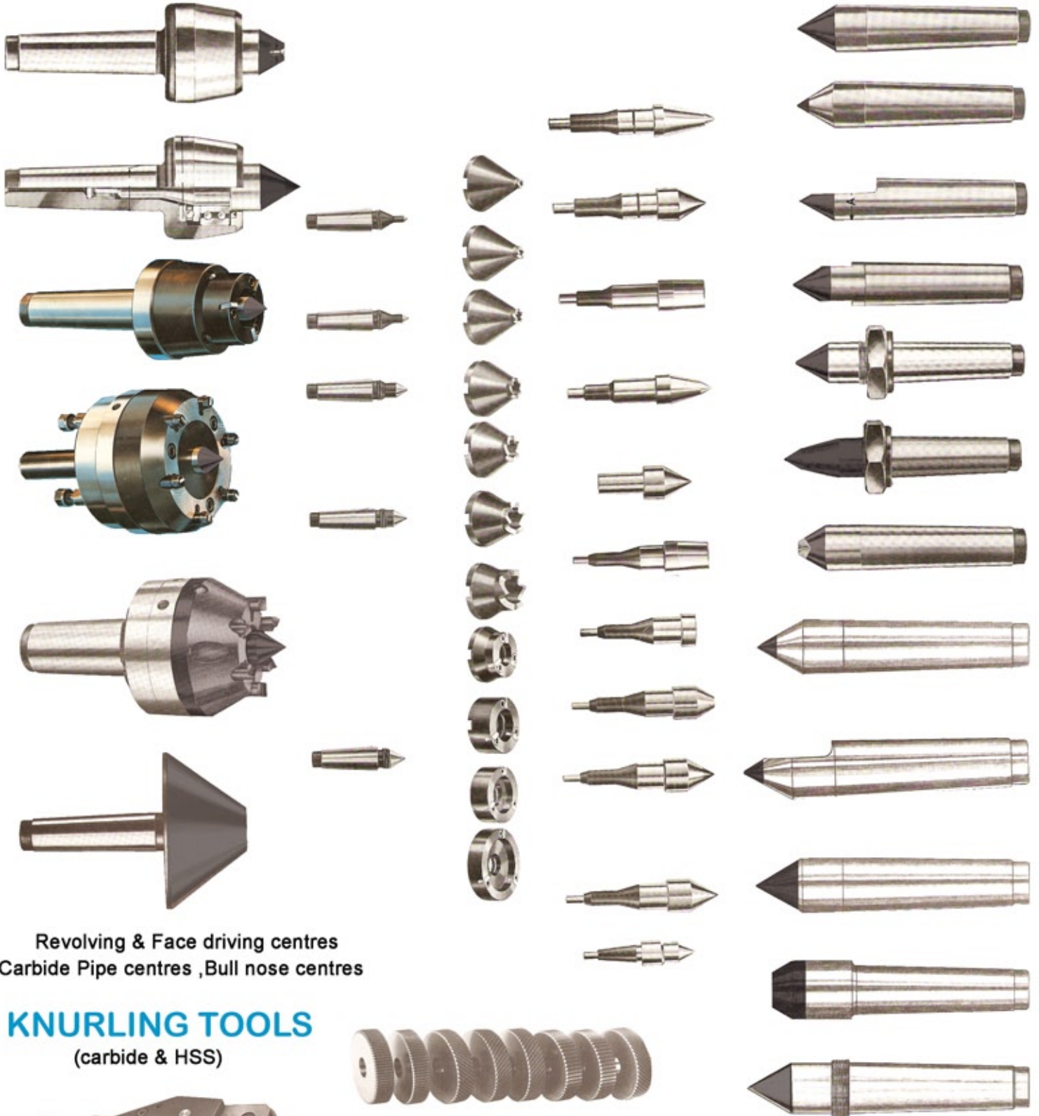
Revolving & Face driving centres Carbide Pipe centres ,Bull nose centres

(All Types , All tapers ,all sizes ,male, female & Bull nose)