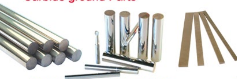
Carbide ground Rods & Flats & Tips dia (0.1 mm To 150 mm ,length up to 500 mm)