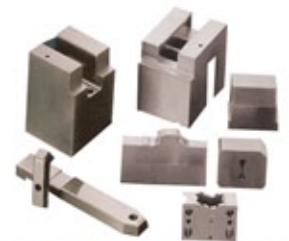
Carbide Precision Parts as per customers Drawings