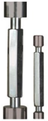
Carbide Plug gauges