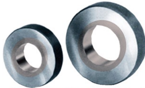
Carbide Ring gauges (std & spls)